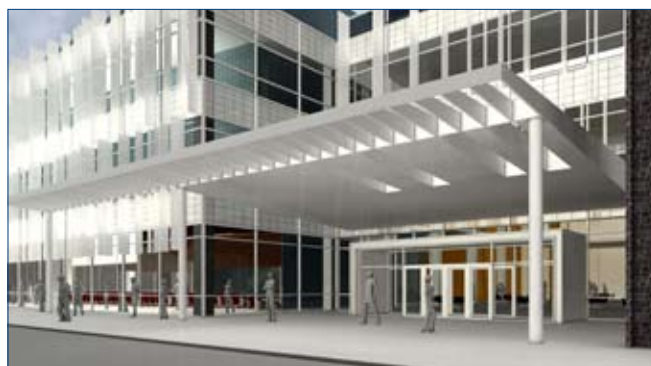
The main entrance of the Bardeen Quad.