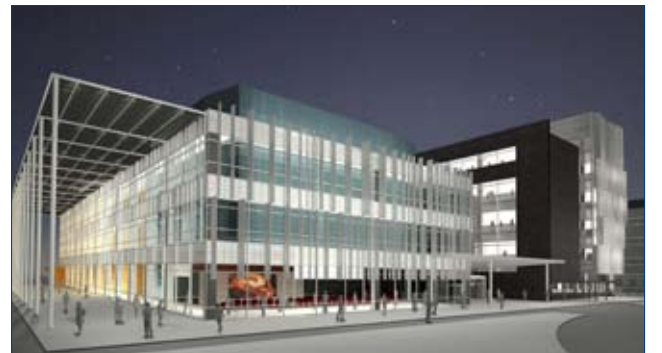
A view of the building from the Beckman Quad, at night.