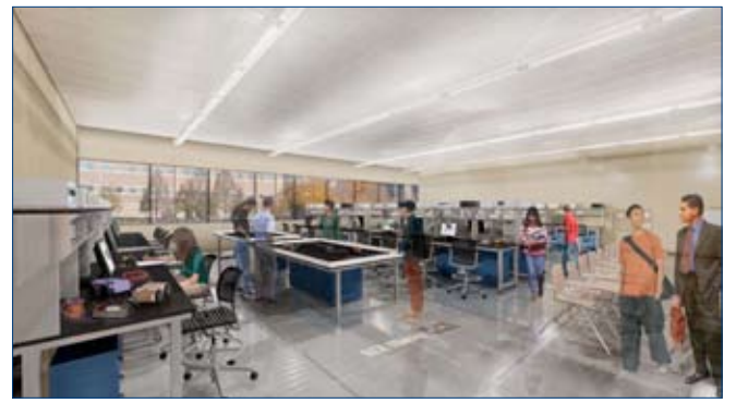
A rendering of the ECE 110 lab.