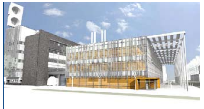
A view from Wright Street (west side).